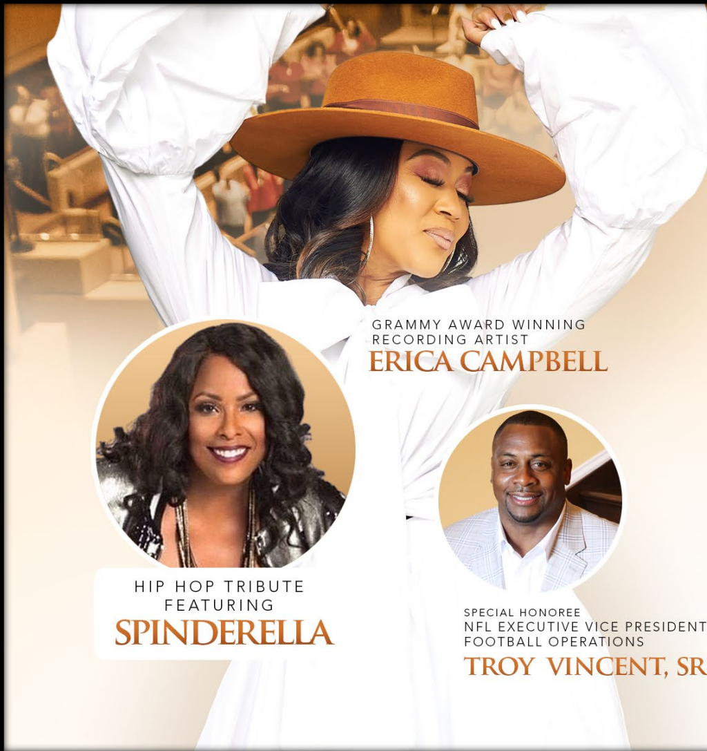
GRAMMY AWARD WINNING RECORDING ARTIST ERICA CAMPBELL