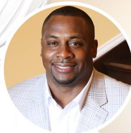
SPECIAL HONOREE NFL EXECUTIVE VICE PRESIDENT FOOTBALL OPERATIONS TROY VINCENT, SR.