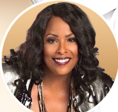
HIP HOP TRIBUTE FEATURING SPINDERELLA