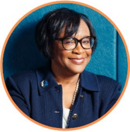
CYNT MARSHALL Dallas Mavericks CEO