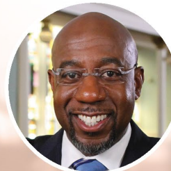
TRAILBLAZER AWARD REV. DR. RAPHAEL WARNOCK