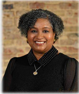
Rep. Rhetta Bowers